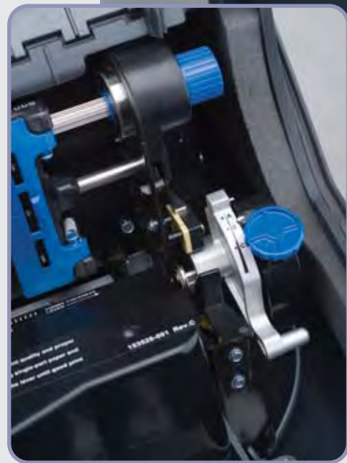
Platen adjustment feature