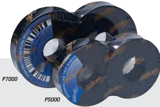
Special formulation and larger capacity spool delivers higher performance and lower cost