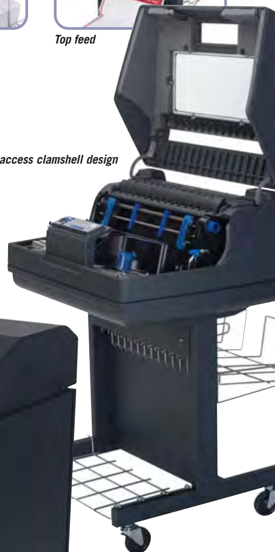
Easy access clamshell design