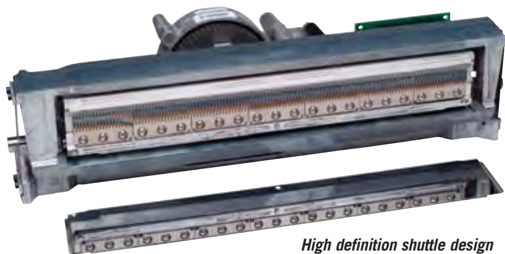
High definition shuttle design

The nominal print density for these printers is 180x180 dots per inch (DPI). Alternately, 120x120 and 90x180 DPI modes are available when image detail can be traded for speed. The printers incorporate special fine tip technology to produce much smaller dots than the standard P7000. All of this is driven by the P7000's PSA3 controller, which provides the necessary power to drive these complex graphics at full speed. The result is the sharpest highest quality image ever produced by Printronix.