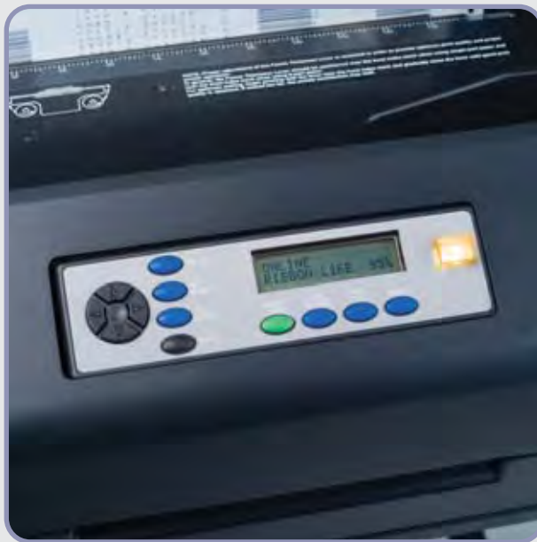
Plan print jobs with precise ribbon life indicated on panel