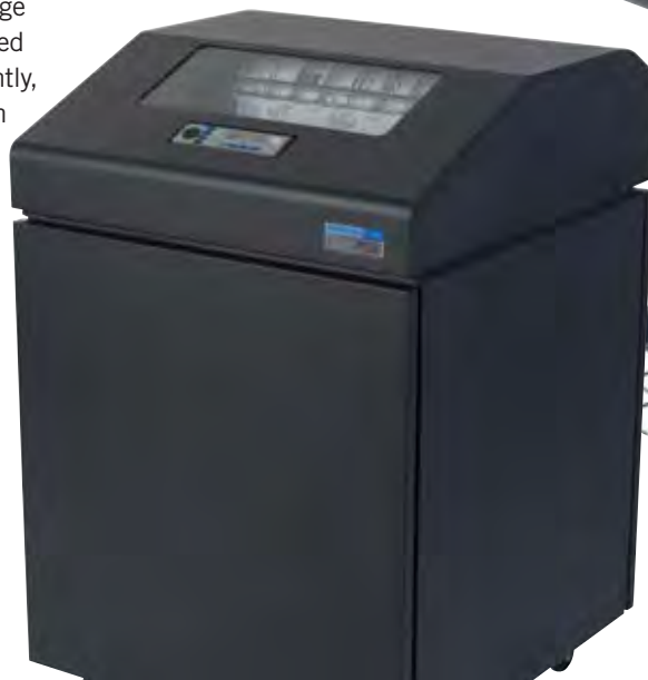
Enclosed cabinet design

The enclosed cabinet models provide for near silent operation, making these printers perfectly suitable for use in the quietest of office environments. In addition, these models provide the best paper handling for large print runs. All input paper is sealed inside and protected from bumping and contamination. Even more importantly, an elegantly simple, but highly effective combination of moveable fences and chains allows for neat stacking all the way up to a full box of paper. For tougher forms that tend not to re-fold well, a SureStak power stacker option is available for the enclosed cabinet models. With this option, even the toughest forms can be printed and stacked neatly up to a full box. So, in either configuration, the enclosed cabinet models are your best choice for large unattended production printing applications.