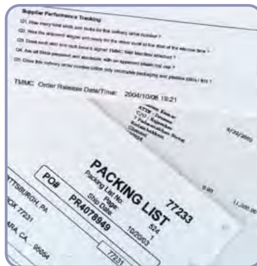
Sharp image quality