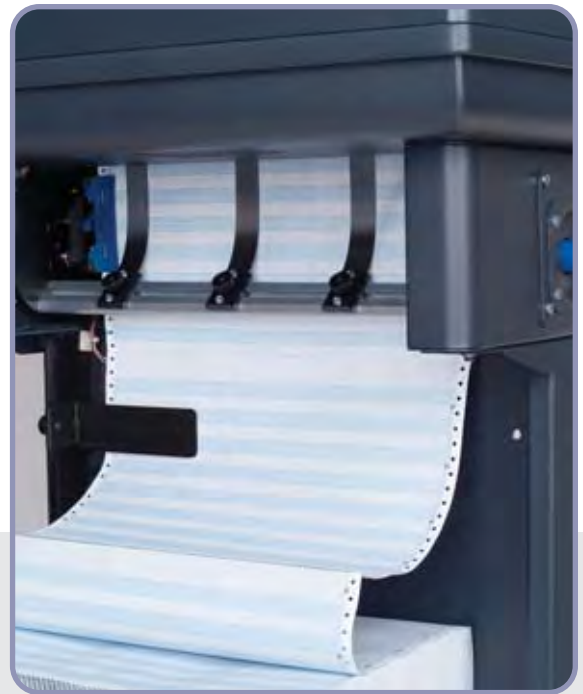
Push tractor system eliminates forms loss

The smart paper system automatically ejects the paper for tear off after the page or job is printed, and then retracts it as soon as the next job is sent. Or, at any time, you can use the Eject key to present or return forms as necessary for tear off.